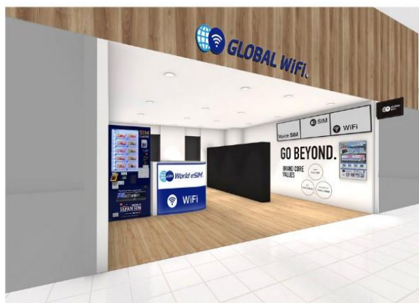
Terminal 1, 4th Departure Floor South Store

Kansai International Airport Terminal 1 is wide from north to south, and the previous one-store system made it difficult for customers to find. Depending on the counter where they needed to check-in, customers had to walk a long distance. In addition to resolving these issues by having two-store system in the north and south, we believe that we will be able to provide more comfortable telecommunication-related services for the growing demand in overseas travel and tourism to Japan.