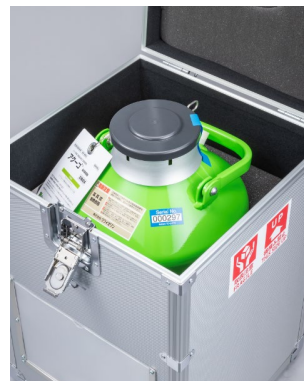
Hard case and dry shipper for transportation