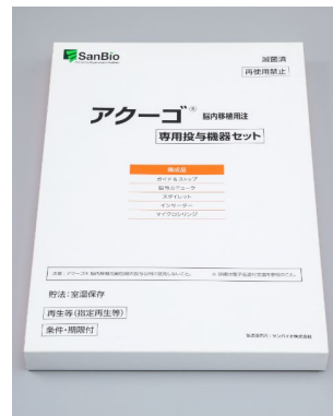
Outer package for dedicated delivery device set