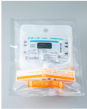
Dedicated preparation solution