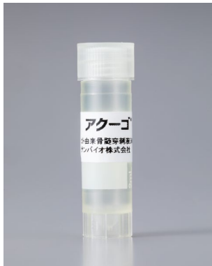
Vial containing cell suspension for intracranial implantation